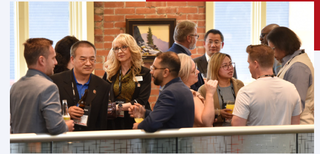
Thank to you our current 5-year pledge benefactors